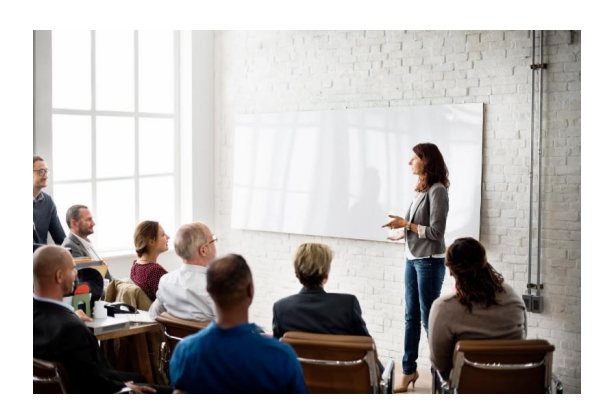
Online Certified Trustee Program