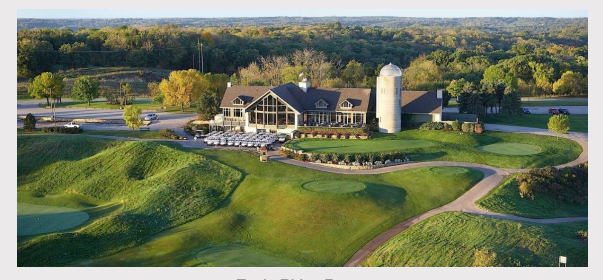
Eagle Ridge Resort 444 Eagle Ridge Drive Galena, IL 61036