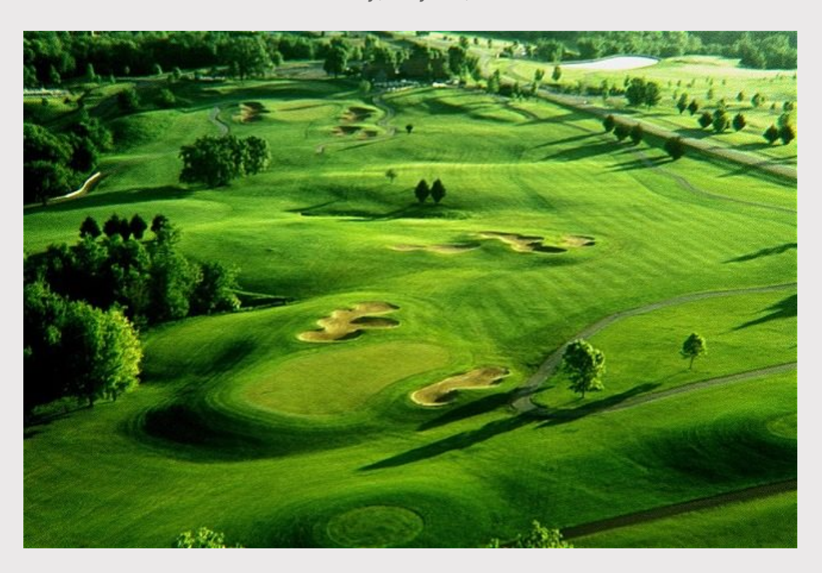
Eagle Ridge Golf Club - The North Course 444 Eagle Ridge Drive Galena, IL 61036

2025 Heroes Family Fund Charity Golf Outing Tuesday, May 6th, 2025