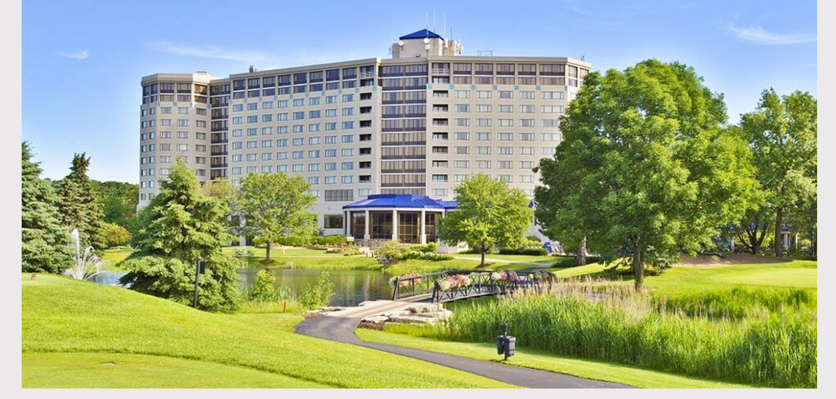
Oak Brook Hills Resort 3500 Midwest Rd. Oak Brook, IL 60523