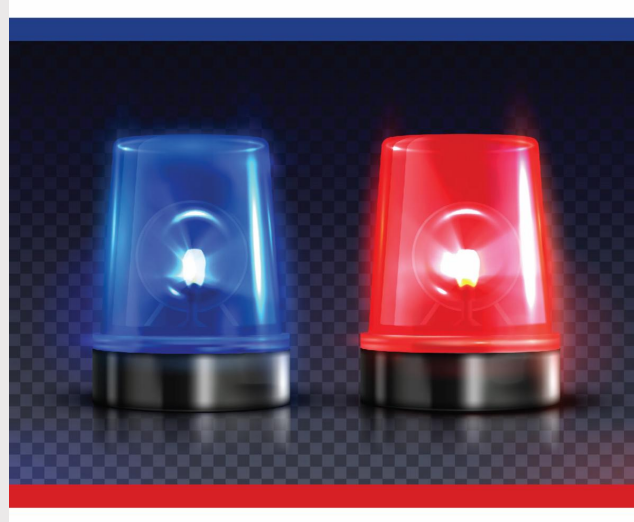
ILLINOIS PUBLIC PENSION FUND ASSOCIATION