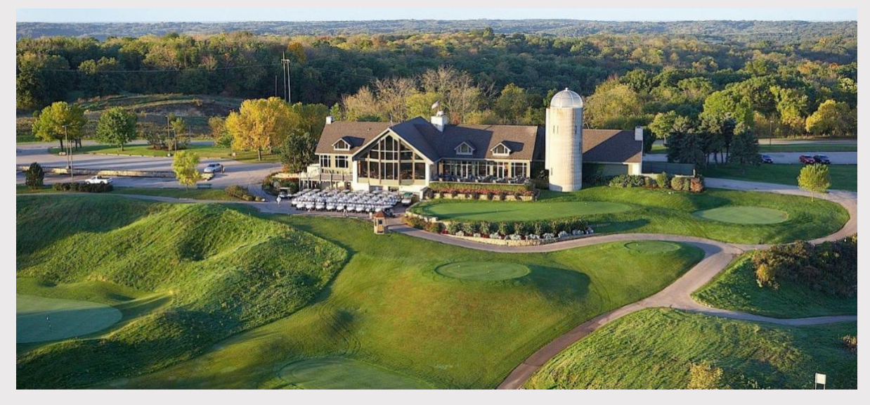
Eagle Ridge Resort 444 Eagle Ridge Drive Galena, IL 61036