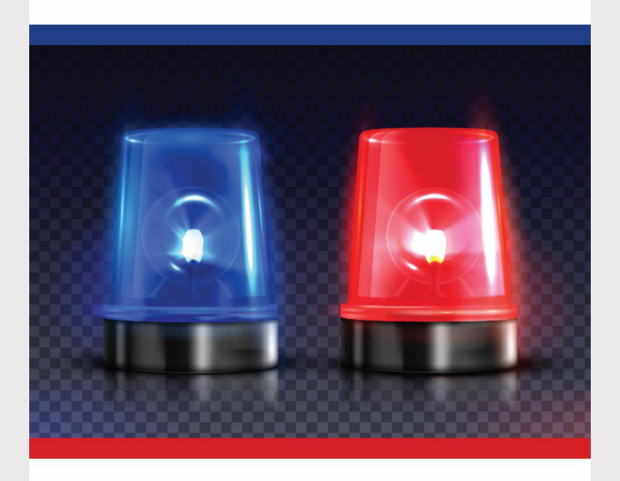
ILLINOIS PUBLIC PENSION FUND ASSOCIATION