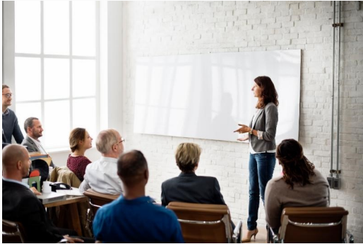
Certified Trustee Program