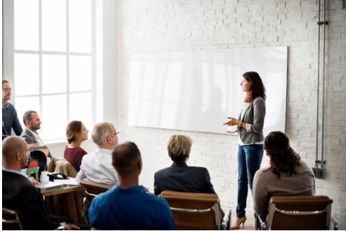
Certified Trustee Program