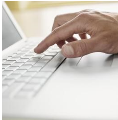
Online Training and Free Online Training for IPPFA Members