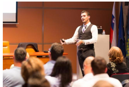
32 Hour Certified Trustee Program Offered in four eight-hour modules