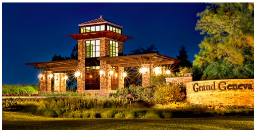
2018 MidAmerican Conference Grand Geneva Resort, Lake Geneva, WI October 2 -5