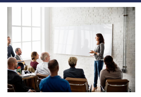
<u>Certified Trustee Program</u> <u>Registration now open for 2018</u>