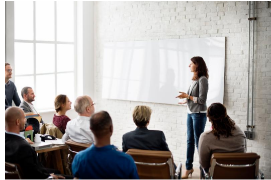
Certified Trustee Program