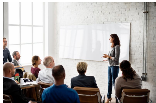
Certified Trustee Program