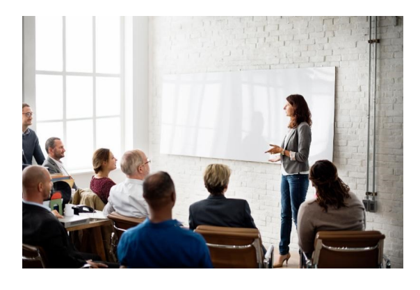
Online Certified Trustee Program