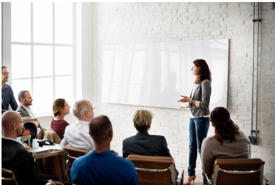
Certified Trustee Program